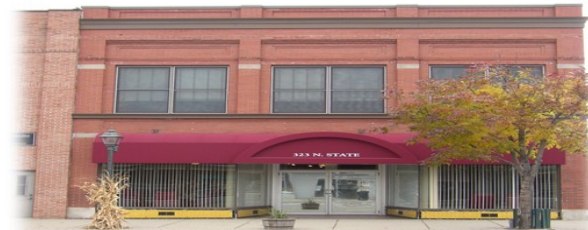
Administrative Services are located at the Echols Building, 323 N. State St., Caro