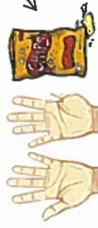
User's contaminated hands touch food. The user is now at risk for Hep A

One dose of the Hepatitis A vaccine is 95% effective at preventing disease, hospitalization, or death