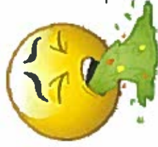
Infected with Hep A

One dose of the Hepatitis A vaccine is 95% effective at preventing disease, hospitalization, or death