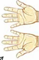
Contaminated drugs are now in the hands of the user