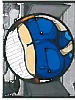
Hep A infected drug dealer stores drugs in contaminated areas

You can get Hepatitis A by putting something in your mouth that has been contaminated with the poop of a person with hepatitis A. To avoid getting the disease or spreading it to friends and family, consider getting your Hep A vaccine.